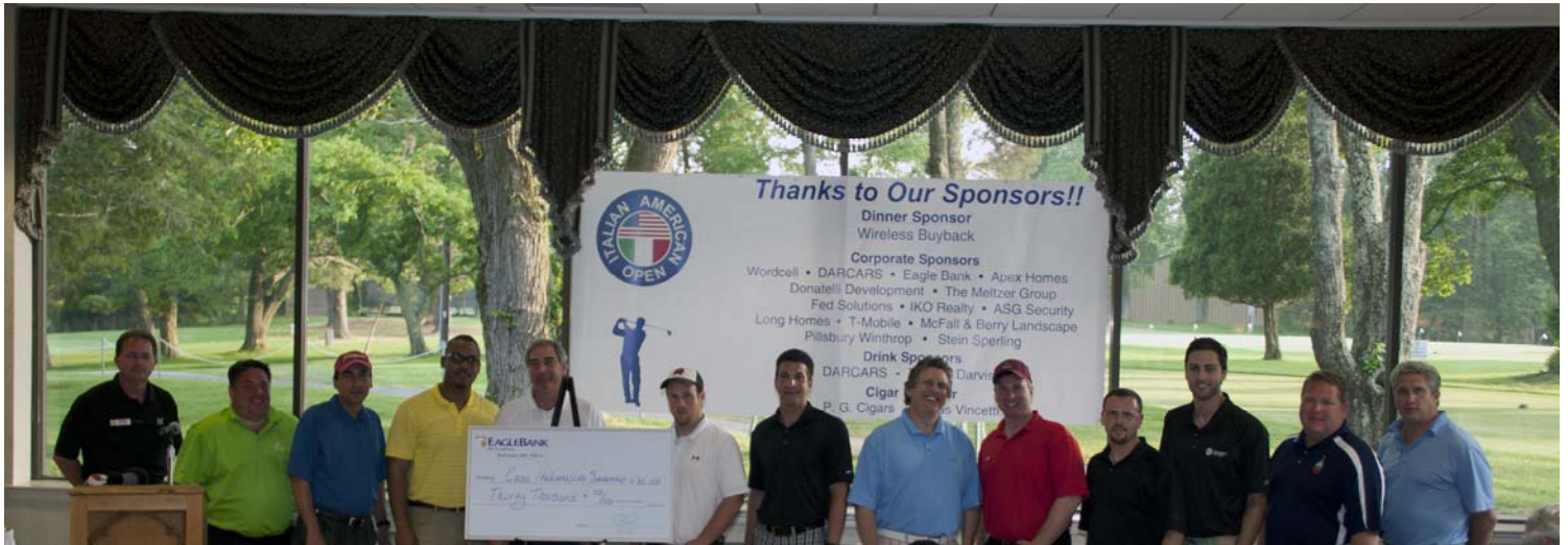
Thanks to our Italian American Open Golf Sponsors!